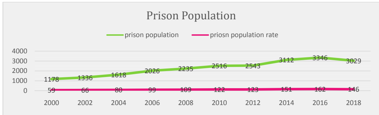
Figure 1.2 - Prisons population trend in RNM 43

To conclude, the overcrowding in the penitentiary has significantly decreased, but there is still space for improvement. DES needs to improve the accommodation conditions in all penal institutions and respect the dignity of the prisoners. According to the latest data obtained for this paper, the total number of sentenced persons in all prisons is 1883. The number of detained persons is 291 and 13 children in CEF Volkovija Tetovo.